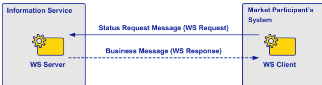
Figure 7: Information Service Channel

Information Service provides Web Service as a channel to access the information. Market Party System must implement specific WS Client to use Information Service. The details of the Web Service Channel are specified in section below.